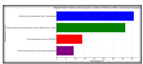
Figure 2: Readmission Rates and Causes in Elderly Patients Undergoing Colorectal Surgery